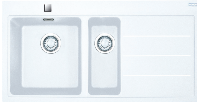
*Image has Strainer Tray pictured in small bowl