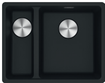
MRG260-34/15 SBL MB