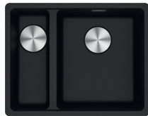
MRG260-34/15 SBL ON