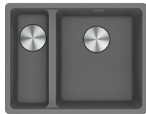
MRG260-34/15 SBL SG