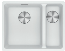
MRG260-34/15 SBR PW