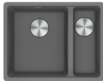
MRG260-34/15 SBR SG