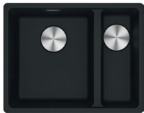
MRG660-34/15 SBR MB