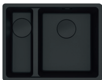
MRG260-34/15 SBL MB