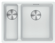
MRG260-34/15 SBL PW