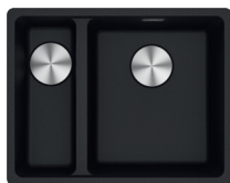
MRG260-34/15 SBL ON