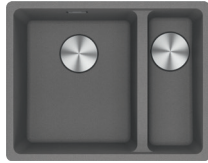
MRG260-34/15 SBR SG