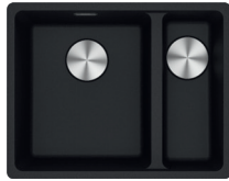
MRG260-34/15 SBR ON