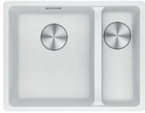
MRG660-34/15 SBR PW