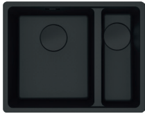
MRG660-34/15 SBR MB